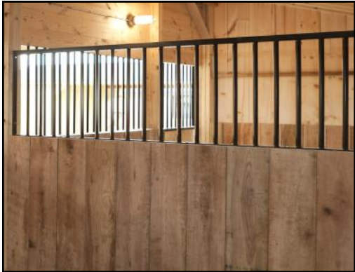
ABOVE: 4' wall with 2' metal grill BELOW: Solid divider wall