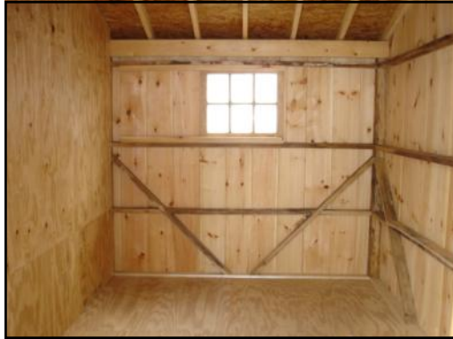
Inside of tack room - One window, full floor, and solid divider wall