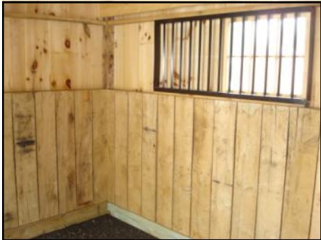
Inside of stall - Kick board and window with metal grill; No floor