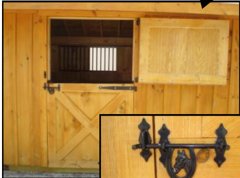
Dutch Door with horseshoe hardware